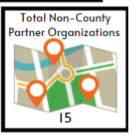
Table I: Count of individuals and agencies directly receiving surveillance reports. (Does not include numerous partners receiving forwarded reports indirectly)